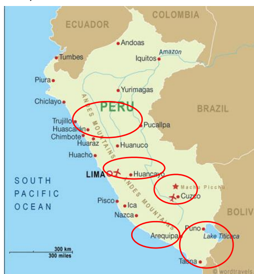
Graph 1: New Quinoa Production Areas in Peru, 2014.